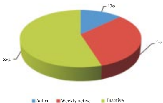
Figure 1. Percentage of antiplasmodial activity \text{IC}_{50} values of Clathria indica associated bacterial strains against Palsmodium falciparum .

University, Rajakkamangalam, Kanyakumari District, Tamil Nadu, India. All the collected samples were washed thrice with tap water and twice with distilled water to remove the adhering associated animals. One gram of sponge samples was cut into small pieces and serially diluted. Diluted sample was subjected for continuous shaking in a thermostat shaker and plated in triplicate on Zobell Marine agar 2216 medium (HiMedia Laboratories Pvt. Limited, Mumbai, India) using pour plate method. The plates were incubated in an inverted position for 24 h at (28 \pm 2)^\circ\text{C} and the colonies were counted and recorded. Based on the morphological characteristics (forms, elevation, margin and colour of the colony), the colonies were selected and restreaked thrice in a nutrient agar medium (HiMedia Laboratories Pvt. Limited, Mumbai, India) and stored on nutrient agar slants.