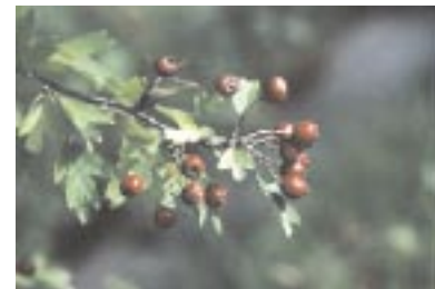
Figure 1 Taxonomic classification of Crataegus oxyacantha Linn [6,7]

Kingdom: Plantae Division: Angiospermae Class: Magnoliopsida Order: Rosales Family: Rosaceae Sub-family: Maloideae Tribe: Crataegeae Genus: Crataegus Species: Oxyacantha